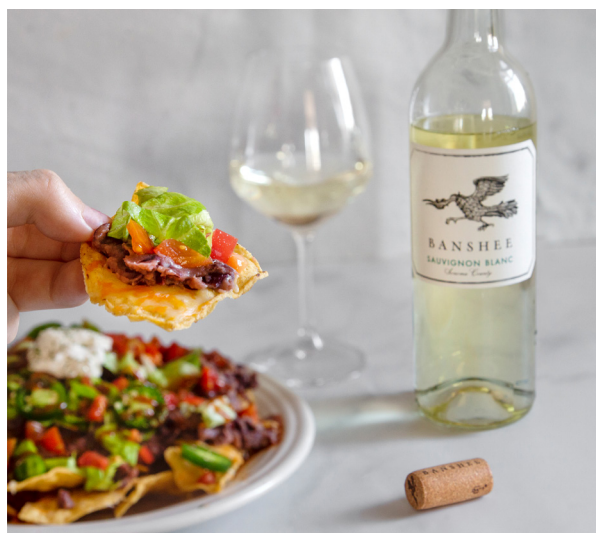
Banshee Sauv Blanc + nachos = snacking perfection!